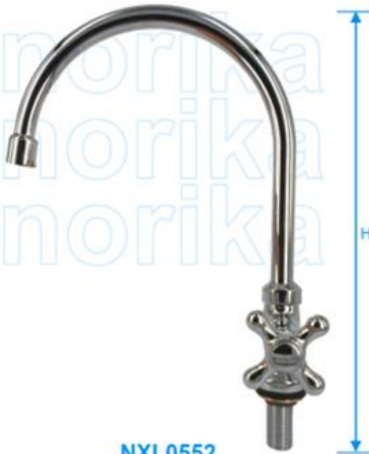
NXL0552 (Cross Handle)