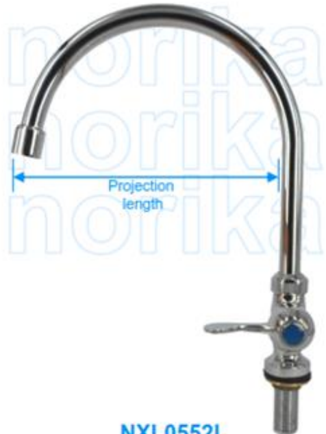
NXL0552L (Lever Handle)